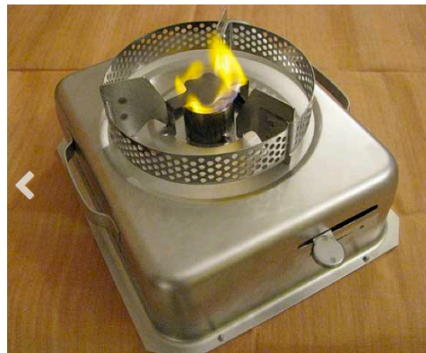
Figure 2: Single Burner Stove