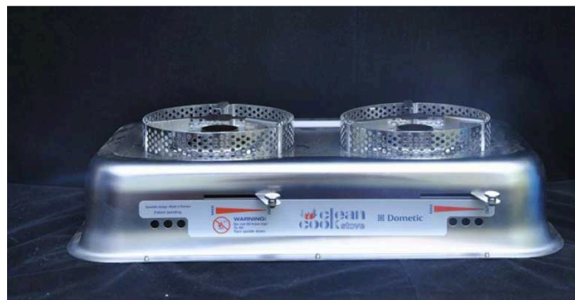
Figure 1: Double Burner Stove

The stoves have a variable lifespan; with the Aluminum model having a lifespan of 6 years while the stainless steel model having 10 years. The canister capacity of the stoves is 1.2 liters with a burning duration of 4-5 hours at maximum heat and 9-10 hours at low heat.